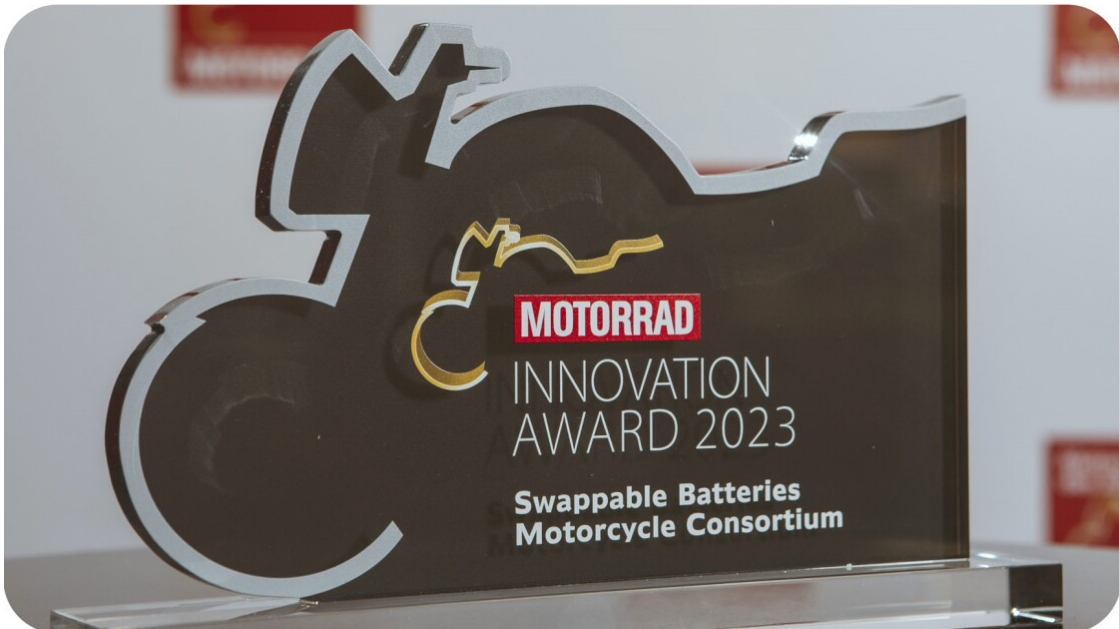
MOTORRAD Innovation Award 2023 for SBMC

The MOTORRAD Innovation Award is now in its fourth year, and it is the first time that an industry consortium has received the award.